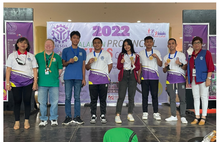
PPSAT's gold medalists