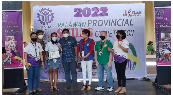
PPSST bags Silver in Welding