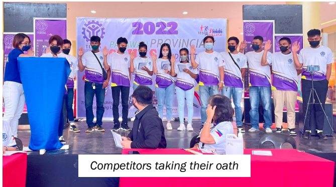
Competitors taking their oath