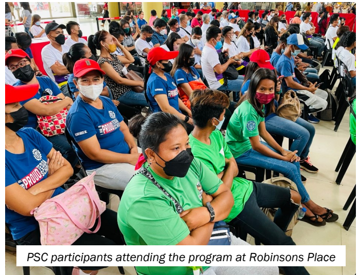
PSC participants attending the program at Robinsons Place