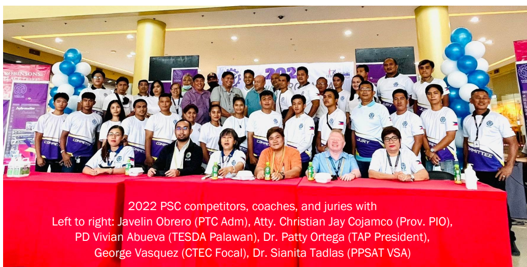
2022 PSC competitors, coaches, and juries with